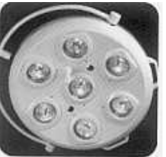
7 reflectors to minimise shadow

*Recommended ceiling height 9 ft. to 10 ft. Options available for lower/higher ceiling heights.