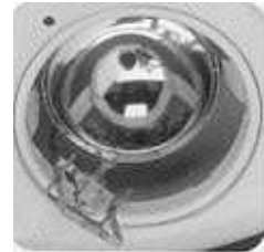
Easy to replace lamps