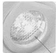
JV grade Honeycomb diffuser