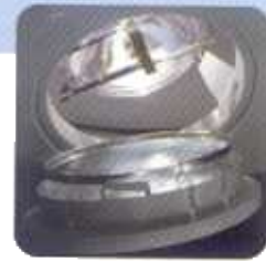
Easy to open bezel