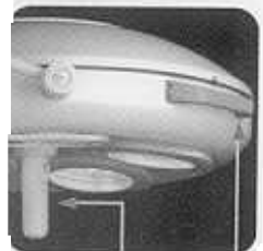
Sterilizable handle/ maneuvering handle