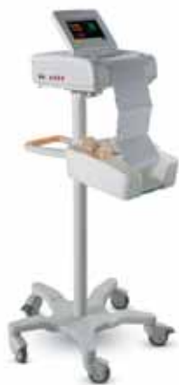
862198 Avalon FM20 862199 Avalon FM30

Roll stand enables the Avalon FM20 and FM30 to be efficiently wheeled from room to room.