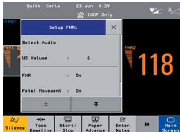
Setup window with touchscreens and an intuitive user interface.