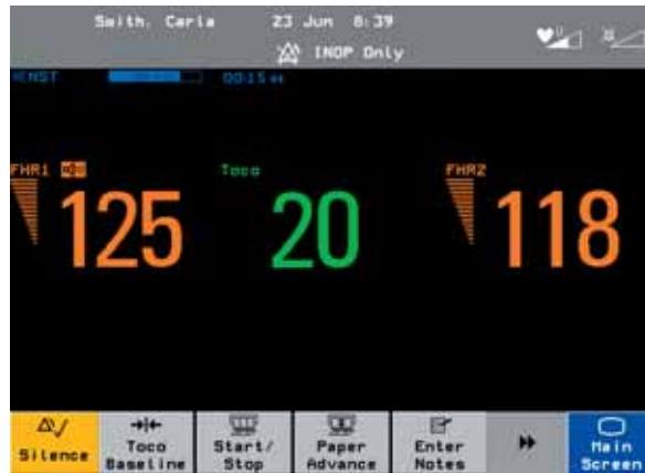
Automatic screen layout for optimal screen size.