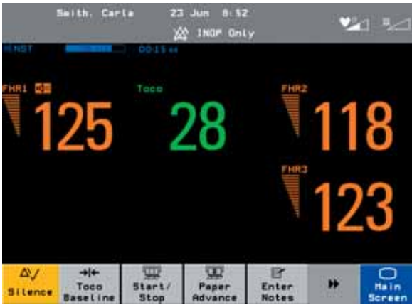
New functionality in the FM20 and FM30 includes the capability to monitor triplets.*