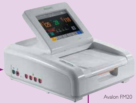
Avalon FM20 or FM30