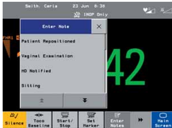
Notes window with user-configured notes for standardization of data and easy trace annotation.