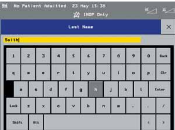
Keyboard entry screen with large display for ease of use.