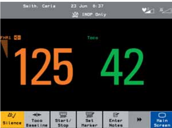
Large numeric displays ease readability.